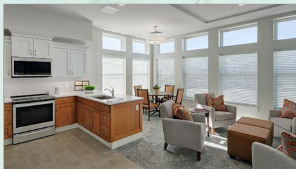
RESIDENT CHRISTIAN SCIENCE NURSES' COMMON AREA