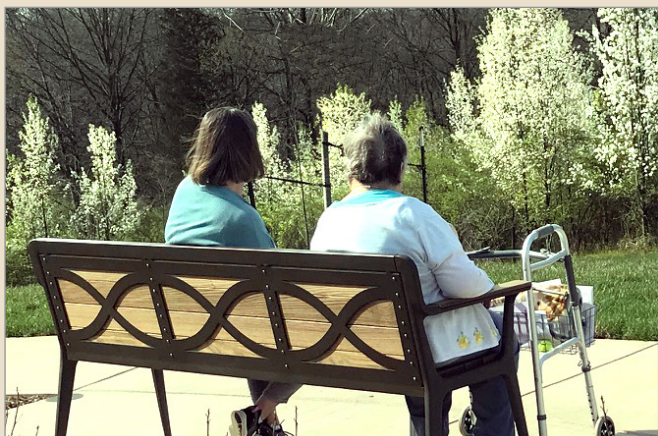
ENJOYING THE FIRST SIGNS OF SPRING, A PATIENT AND CHRISTIAN SCIENCE NURSE ASSISTANT REFLECT ON ITS BEAUTY.

you can also visit our website at www.peacehavenassociation.org/employment/ or email HR@peacehavenassociation.org .