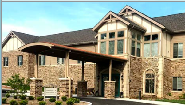
PEACE HAVEN FRONT ENTRY