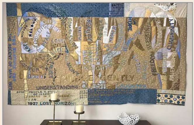
ONE OF THE BEAUTIFUL QUILTS FEATURED ON THE FRONT COVER

We are so grateful to all the talented artists whose creative works hang in our corridors, open areas, and patient rooms, bringing inspiration, light, color, and great joy to our facility.