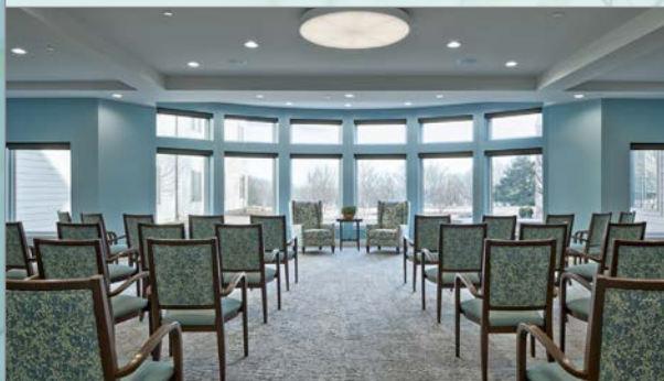
CHAPEL / AUDITORIUM