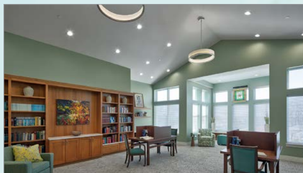
SPIRITUAL RESOURCE LIBRARY