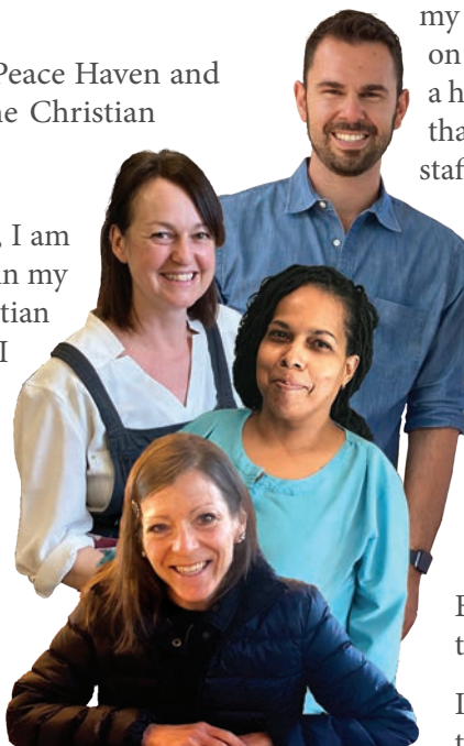
CHRISTIAN SCIENCE NURSING ARTS II MAY 2021

my daily life as well. Studying Christian Science on a daily basis shows me how to demonstrate a higher sense of the Christ. I am grateful for all that I have learned and for all the patients and staff here at Peace Haven.